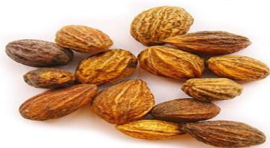
Figure no 1.3 Haritaki