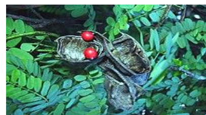
Fig 1.5 : kundumani

The plant is a climber commonly known as Wild Liquorice and found through the plains of India. The mixture is shade dried and ground into powder and taken orally along with cow's milk. Dosage: About 50 ml of mixture is taken twice a day before food for 120 days.