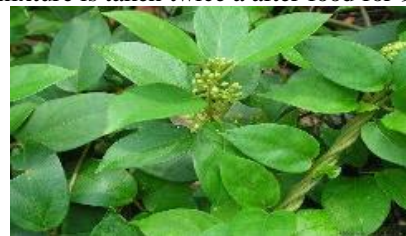
Figure 1.4 : Perun Kurinjan

The plant is a fleshy and large climber found throughout the plains with papery leaves. Leaf powder is taken orally along with cow's milk. Dosage: 50-75 ml of mixture is taken twice a after food for 90 days