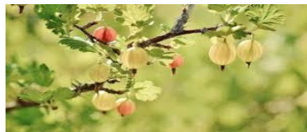
Figure no 1.1 Natural Triphala

□ Sugandhi Triphala: This combination of jatiphalam, ela, and lavangam is known as Sugandhi Triphala. It helps with constipation brought on by Kapha and Vata doshas and is astringent and pleasant in vipaka. 8