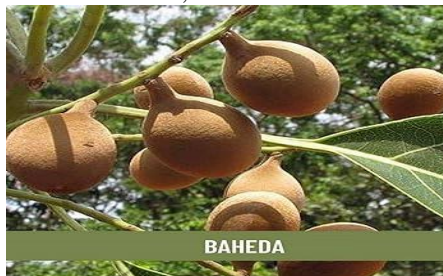
Figure no 1.2 Bibhitaki plant

The fruit has a 17% tannin content as well as gallo-tannic acid (color matter) and resin. Oil from seeds is a greenish-yellow color.