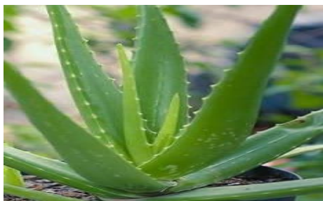
Figure 1.7 : Aloe Vera

Aloe, a popular houseplant, has a long history as a multipurpose folk remedy. The plant can be separated into two basic products: gel and latex. Aloe vera gel is the leaf pulp or mucilage, aleolates, commonly referred to as “aloe juice,” is a bitter yellow exudate from the pericyclic tubules just beneath the outer skin of the leaves. This action of Aloe vera and its bitter principle is through stimulation of synthesis and/or release of insulin from pancreatic beta cells. This plant also has an anti-inflammatory activity in a dose dependent manner and improves wound healing in diabetes mice 11,12 .