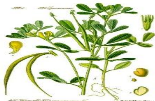
Fig 1.6 : Fenugreek

produced dose dependent decrease in the blood glucose levels in both normal as well as diabetic rats. Administration of fenugreek seeds also improved glucose metabolism and normalized creatinine kinase activity in heart, skeletal muscle and liver of diabetic rats 13 .